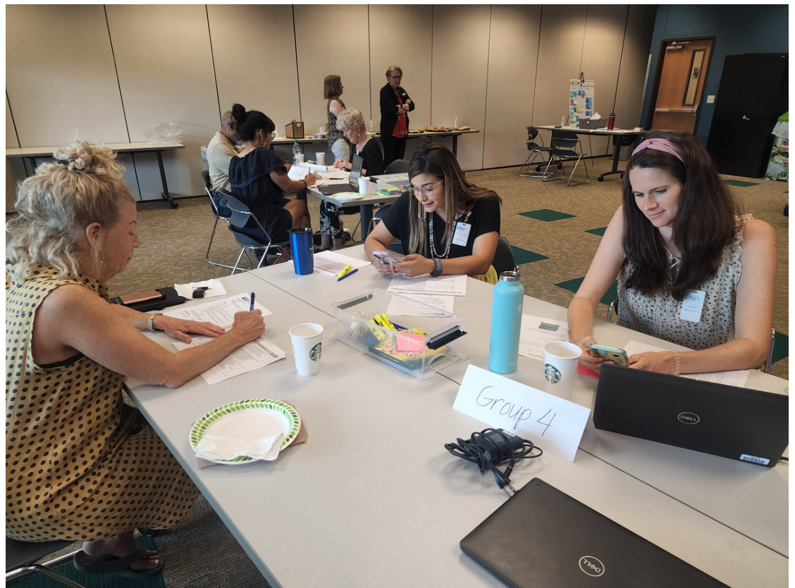
Community representatives discussed and prioritized strategies that will lead to healthier outcomes for children and expecting parents.