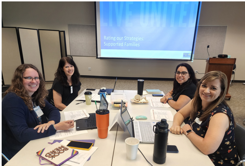
Representatives from across the county met to learn about ways to support families with young children.